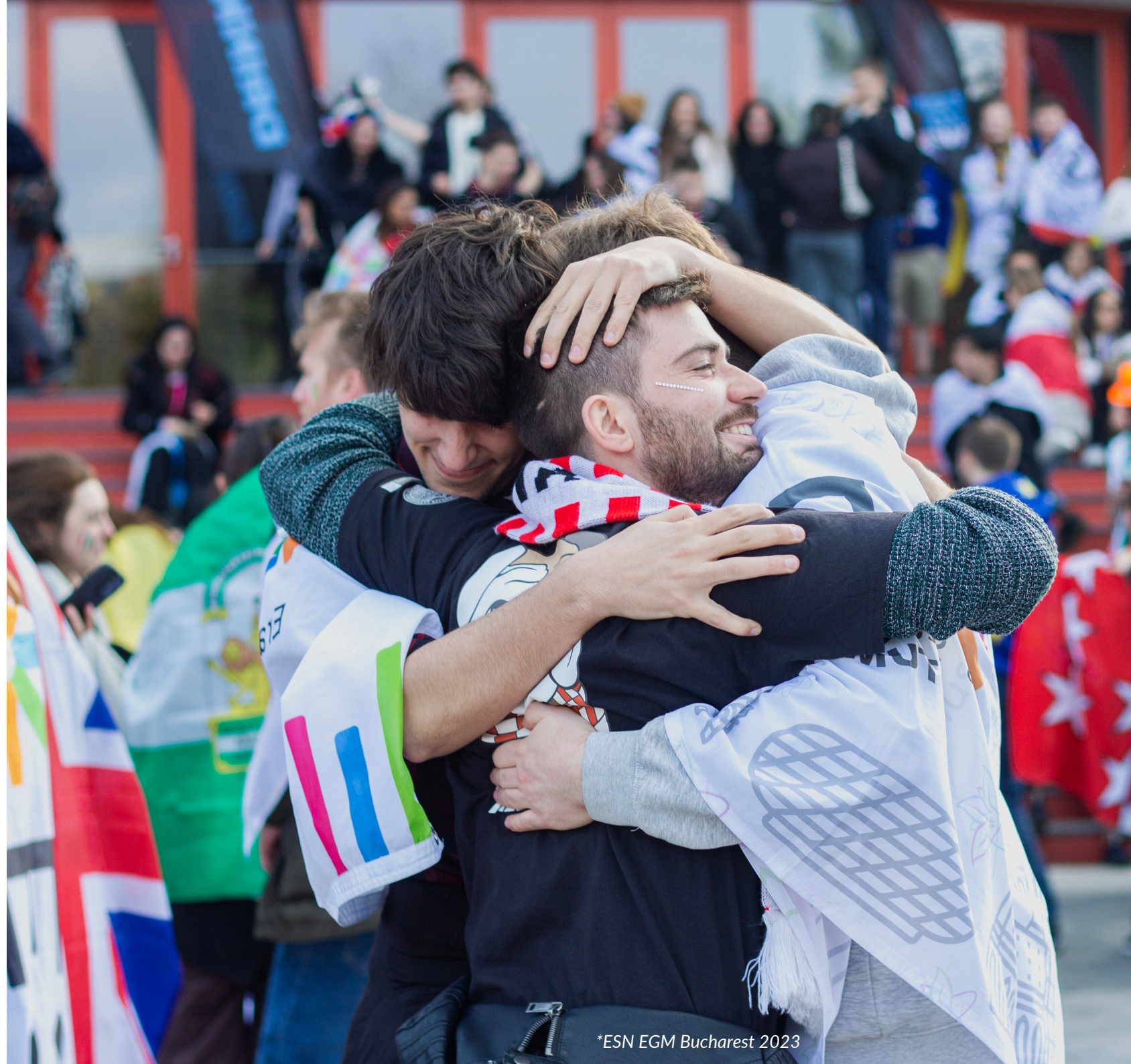
*ESN EGM Bucharest 2023

The center is located on Splaiul Independenței, no. 313, Library Building, Block A, 3rd Floor, Room 3.30 . The opening hours are from Monday to Friday, 09:00 - 17:00 . For further information, the following email address is available: centru.consiliere@upb.ro