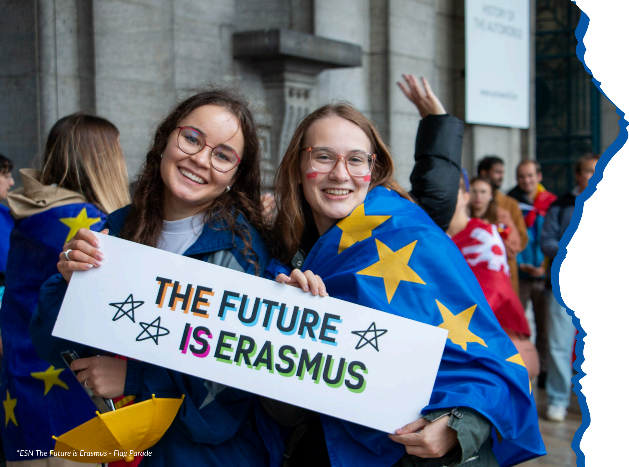
*ESN The Future is Erasmus - Flag Parade