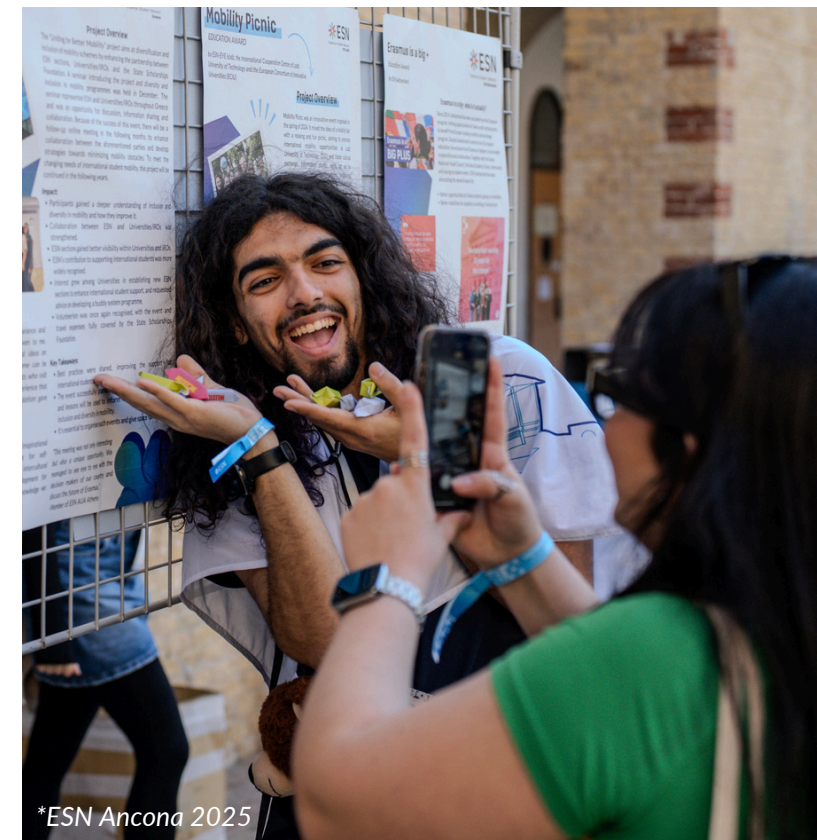
*ESN Ancona 2025

At POLITEHNICA Bucharest , these values are represented locally by ESN Poli, the university's official ESN section . ESN Poli is run by passionate students who organize activities for incoming international students, ensuring they feel welcome and integrated from the very first day.