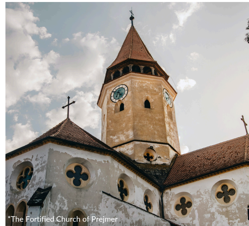
*The Fortified Church of Prejmer