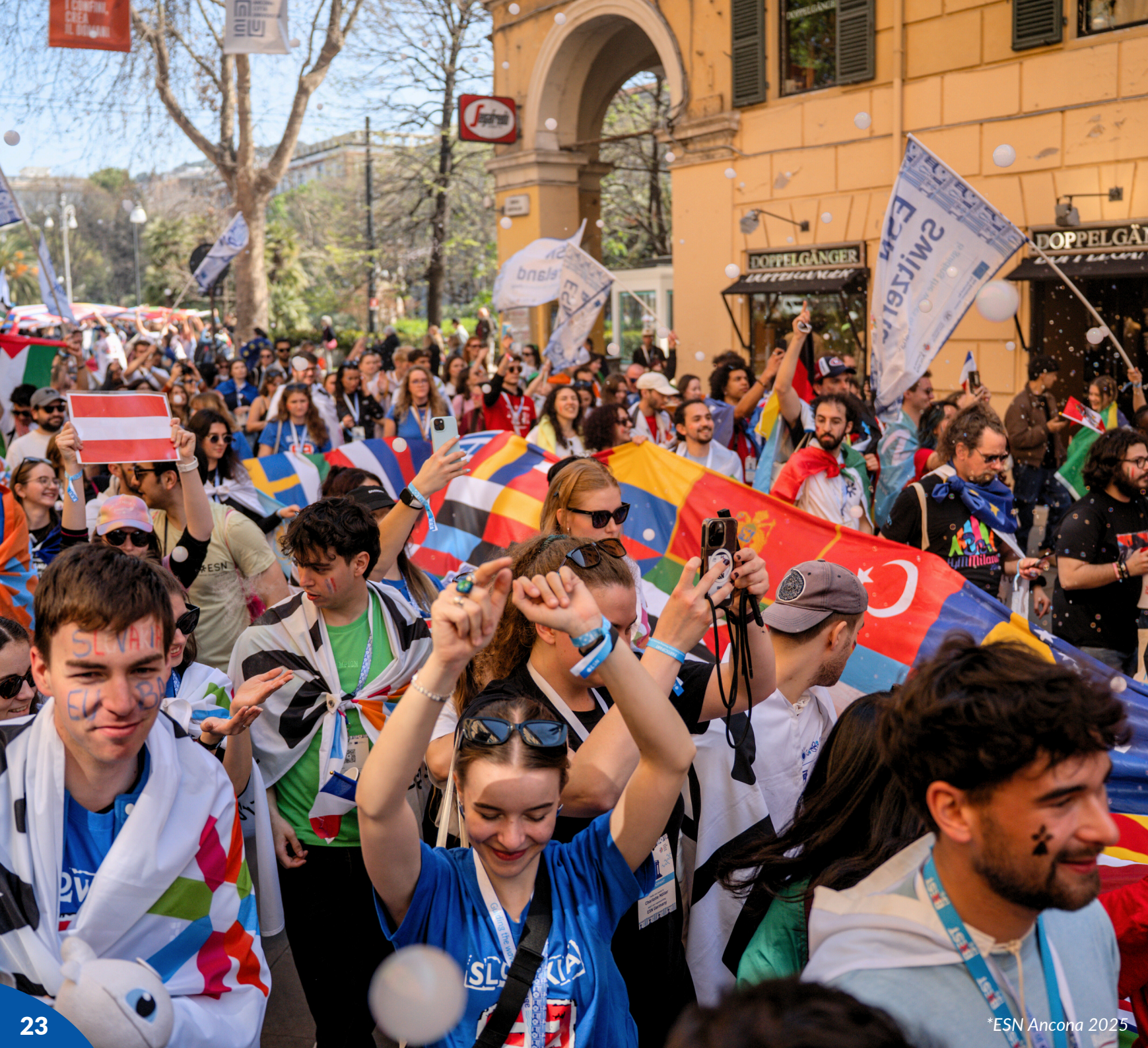
*ESN Ancona 2025