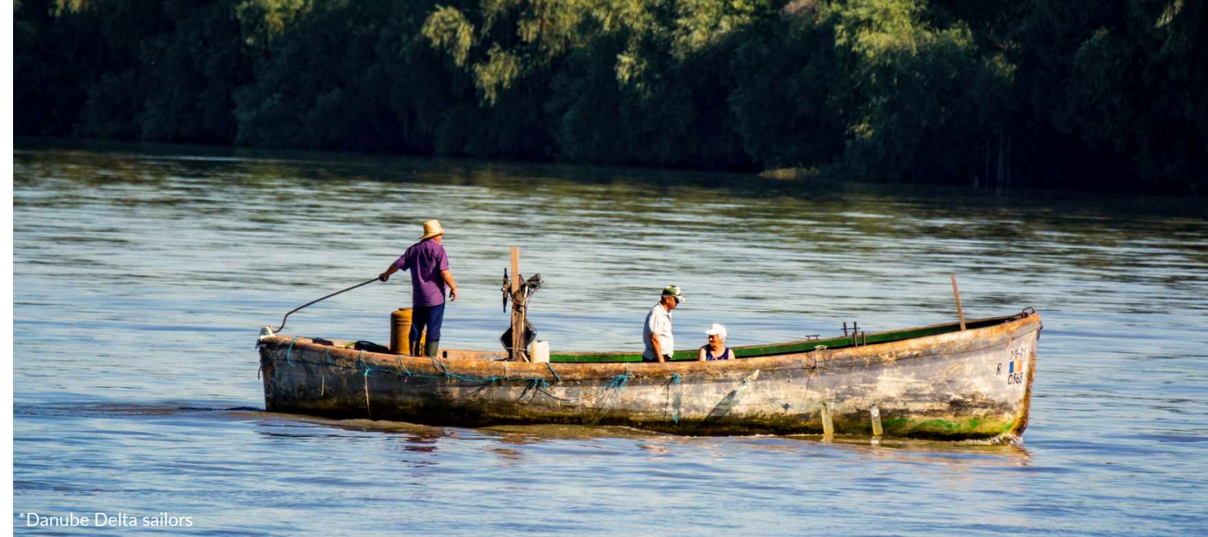
*Danube Delta sailors

In the village of Săpânța, Maramureș, lies the Merry Cemetery, a truly unique graveyard where each wooden cross is painted in vivid colors and features a poetic, sometimes humorous epitaph. Created by local artist Stan Ioan Pătraș in the 1930s, the cemetery reflects a philosophy that embraces death with honesty, irony, and even a smile.