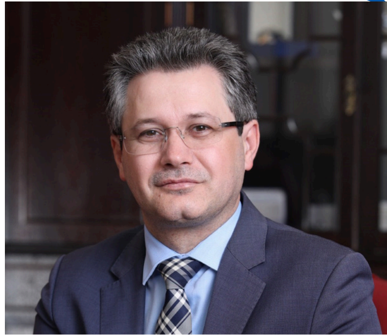
Mihnea COSTOIU RECTOR

POLITEHNICA Bucharest is a true magnet for talent, offering a dynamic, diverse, and inclusive environment where ideas and energy flow freely. Our cutting-edge research centres - CAMPUS and PRECIS - house over 70 fully equipped laboratories focused on some of the most important challenges of our time: clean energy, sustainability, artificial intelligence, robotics, and much more. We deliver solutions - this is why we are connected to over 1,000 companies worldwide .