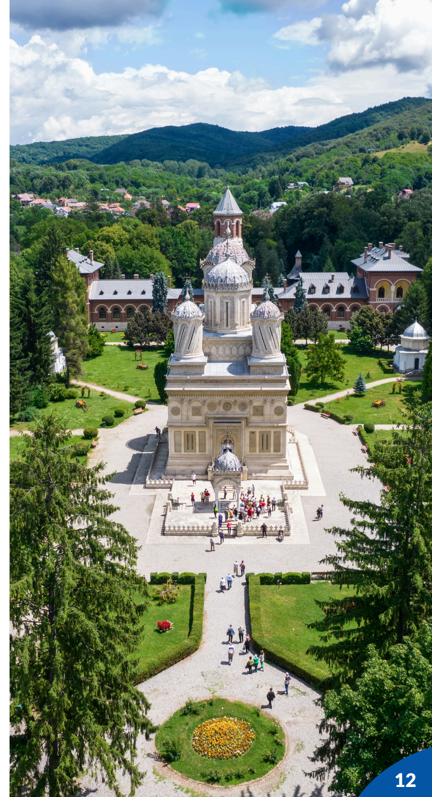
*Curtea de Argeș

Pitești is also strategically located with efficient transportation links to Bucharest, the medieval town of Sibiu, and the Carpathian Mountains , making it an ideal place for people eager to explore both the urban regions and the landscapes that Romania has to offer.