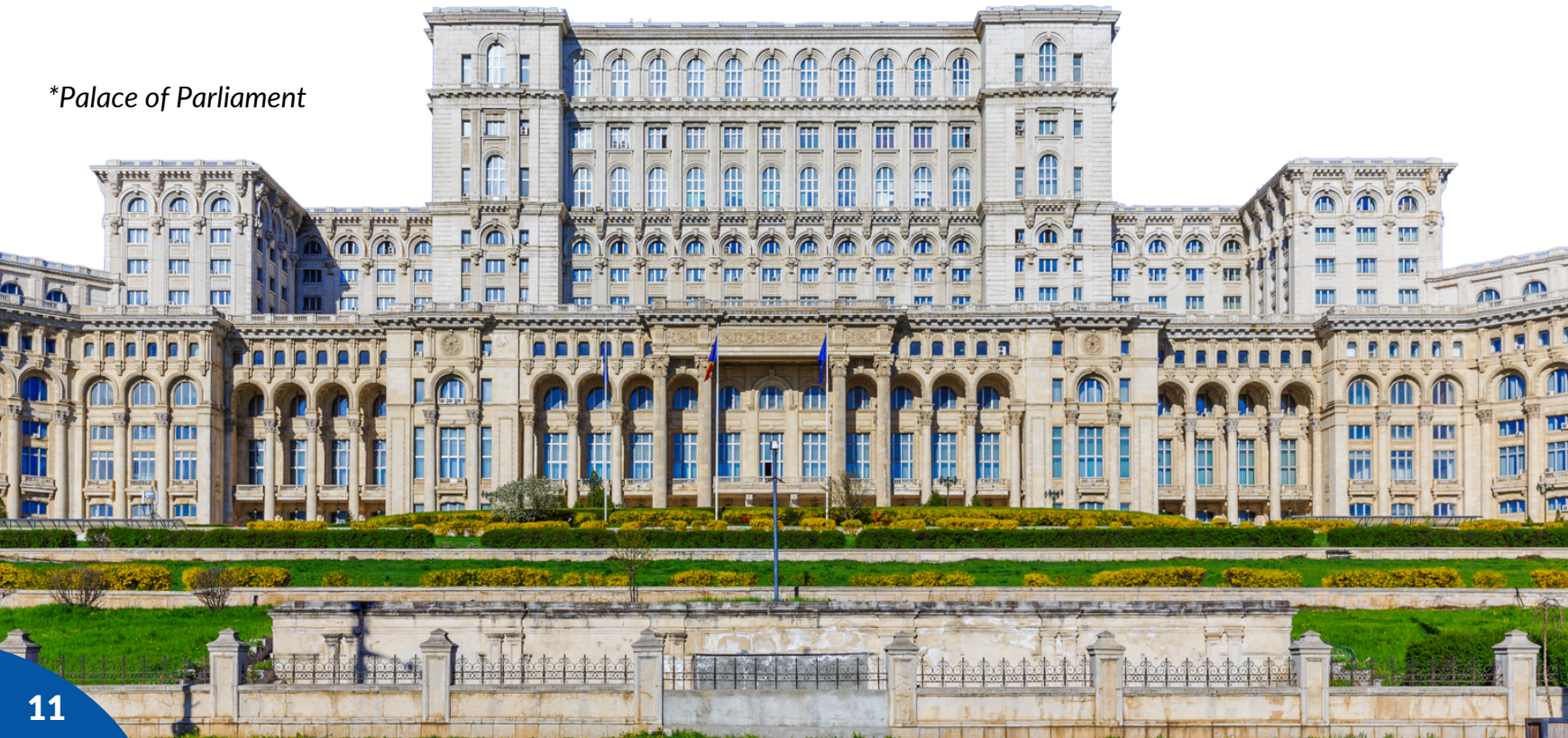
*Palace of Parliament

Though historians trace the actual founding of Bucharest to the 14th century and link it to Voivode Vlad Țepeș (Vlad the Impaler), the tale of Bucur remains deeply rooted in the city's cultural memory and is still told as a poetic origin story. A small church known as Biserica lui Bucur (Bucur's Church) , located near the Parliament building, keeps the legend alive.